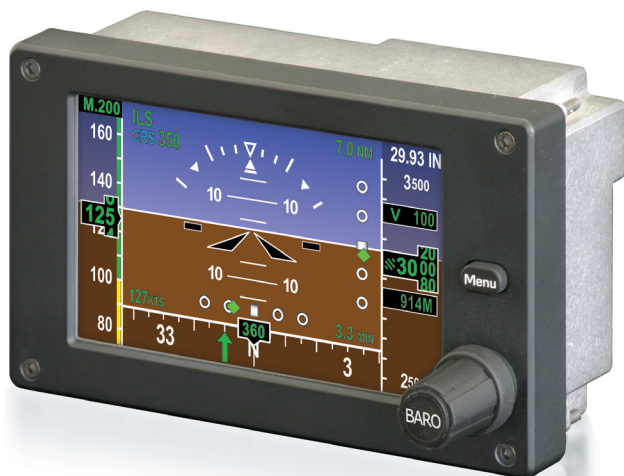
DU-42 Display Unit